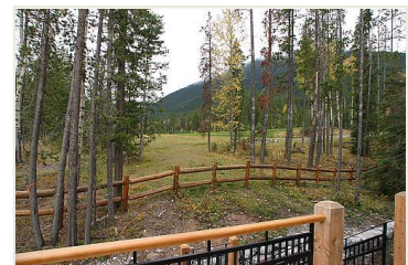
View From Deck