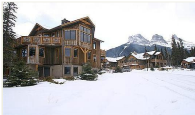
Back Of House With Mountains