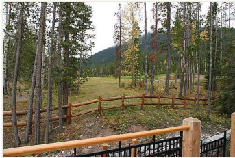
View From Deck